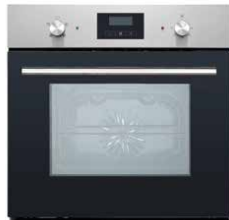
CUL57PGSS.2 true fan electric oven