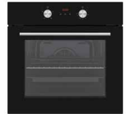
UBO652BK true fan electric oven