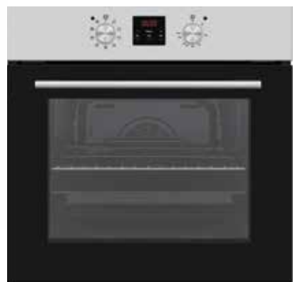
black glass & stainless steel