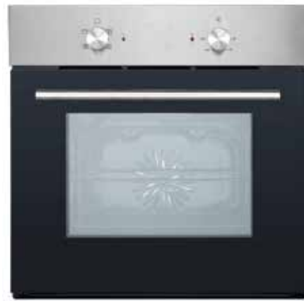
CUL57MMSS.1 true fan electric oven

Every appliance is backed with a 5 year parts and 2 year labour warranty for peace of mind.