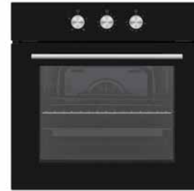
UBO651BK true fan electric oven