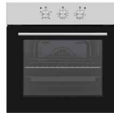
UBO651SS true fan electric oven