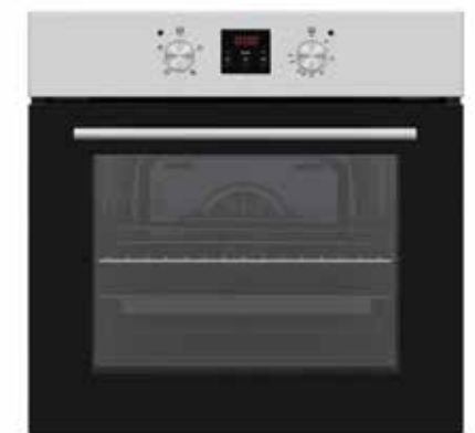
UBO652SS true fan electric oven