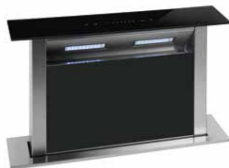
UBDDGS60ABK 60cm downdraft extractor