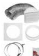
KITVENT1F 125mm ventilation kit for external venting