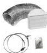
KITVENT2 150mm ventilation kit for external venting