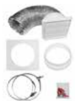
KITVENT1F 125mm ventilation kit for external venting