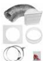
KITVENT1F 125mm ventilation kit for external venting

Most of our hoods are suitable to vent or recirculate and require either a 125mm or 150mm ducting kit for external venting (see below.)