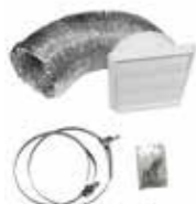
KITVENT2 150mm ventilation kit for external venting