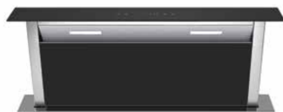
UBDDGS90ABK 90cm downdraft extractor