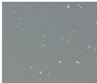
Andromeda Storm | Quartz