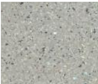
Grey Peppered Spark | Quartz