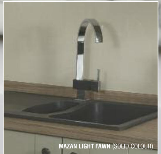
MAZAN LIGHT FAWN (SOLID COLOUR)

..... If you're looking to add a contrasting splashback or feature wall in your kitchen, bathroom or utility room, check out the Mazan® range of dazzlingly beautiful and affordable acrylic glass panels.