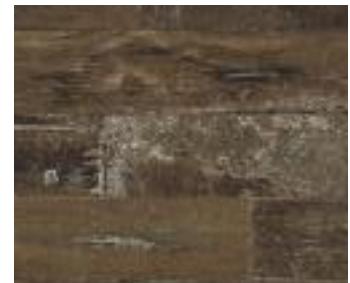
Weathered Stave Wood | Wood