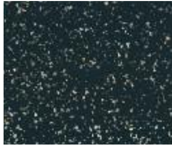
Black Spark | Quartz