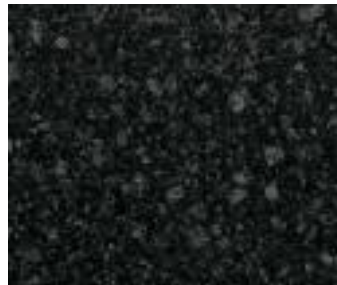
Taurus Black | Satin