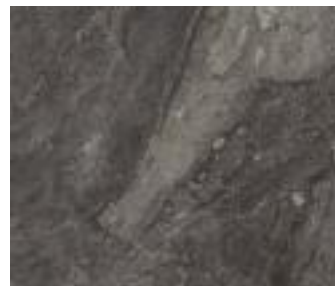
Corinthian Marble | Matt