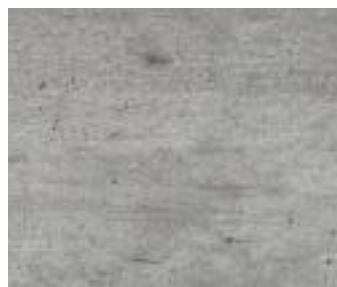
Grey Shuttered Concrete | Stone