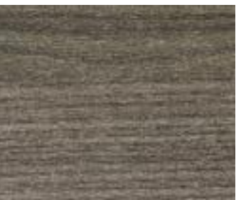
Natural Elm | Matt