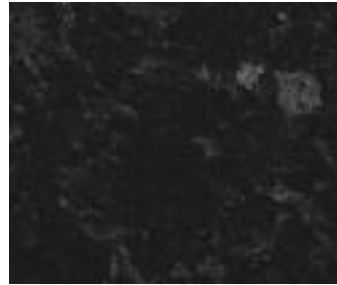
Black Slate | Gloss