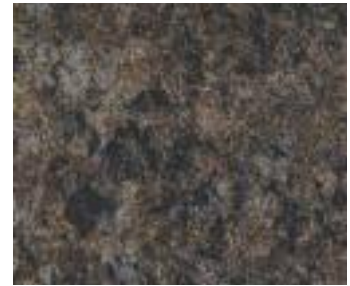
Italian Granite | Glaze