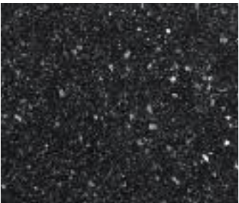
Black Sirius | Sirius