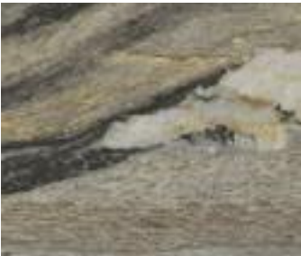
Dolce Vita | Nature