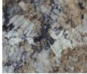
Autumn Granite | Glaze