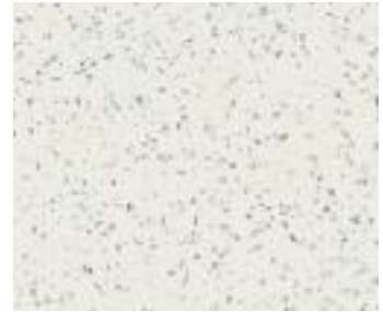
Snow Spark | Quartz