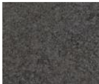
Celtic Granite | Glaze