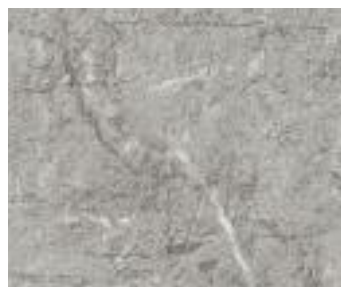
Grey Lightning Stone | Matt