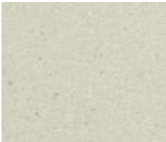
White Sirius | Sirius