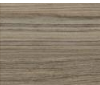
Cypress Cinnamon | Wood