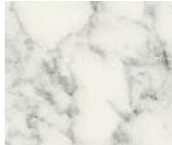
Carrera Marble | Matt