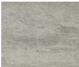
Natural Limestone | Stone