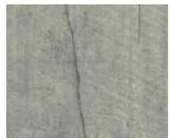
Shorewood | Wood