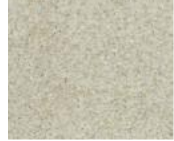
Sand Spark | Quartz