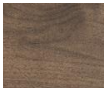
Walnut | Matt