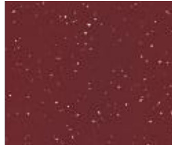
Andromeda Burgundy | Quartz