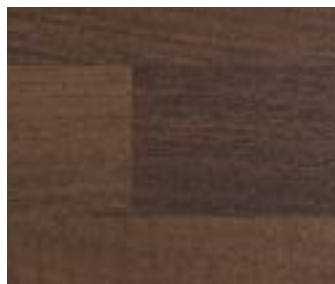
Walnut Butcher Block | Matt