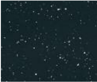
Andromeda Black | Quartz