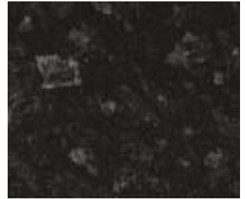
Black Slate | Satin