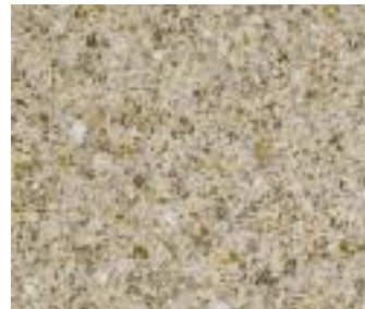
Taurus Beige | Matt