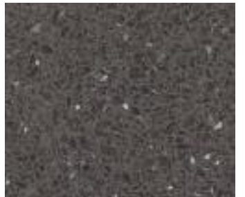
Stone Spark | Quartz