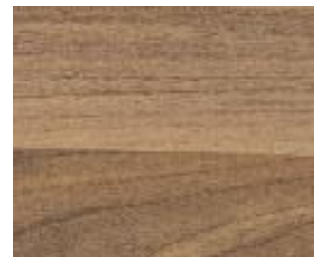
Blocked Oak | Matt