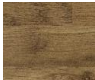
Colmar Oak | Wood