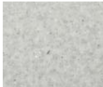
Andromeda Cloud | Quartz