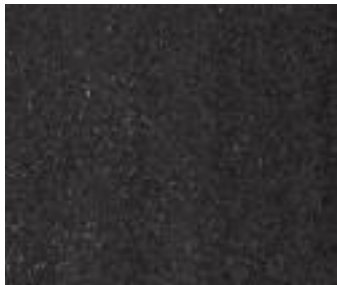
Lunar Night | Glaze