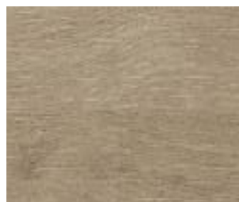
Natural Oak | Wood