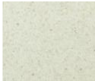
Light Cream Delight | Nature